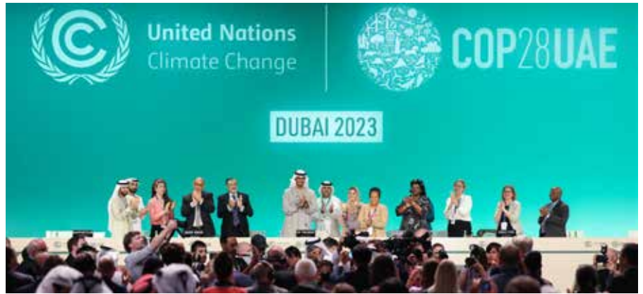
Closing plenary, UN Climate Change Conference (UNFCCC COP28), Expo City Dubai, 13 December 2023, United Arab Emirates

Similarly, greater advancement on the more general issue of financing the energy transition , in particular from rich countries