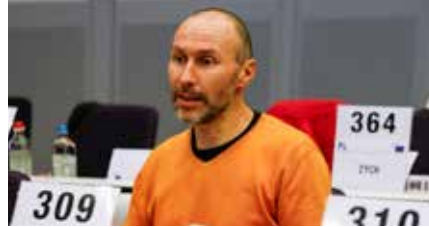
Arnaud Schwartz © EESC

– full of empty words and a wasted chance to save the future of young people.