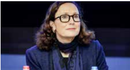
Sandrine Dixson-Declève

During its December plenary session, the European Economic and Social Committee (EESC) held a debate on the Global climate commitments: reflecting on the outcomes of the United Nations Framework Convention on Climate Change (UNFCCC) COP28 1 , with the participation of Sandrine Dixson-Declève , Co-President of The Club of Rome 2 and Diandra Ni Bhuachalla , EESC Youth Delegate COP28 3 .