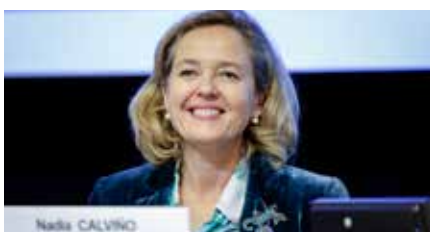
Nadia Calviño

At its last plenary session of the year, the European Economic and Social Committee (EESC) took stock of the work carried out by the Spanish Presidency of the Council of the European Union 1 in the second semester of 2023 and addressed future challenges for Europe.