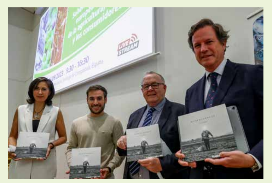
Speakers with the book 'Mariscadoras'

Watch back the opening of the exhibition at: <a href="https://europa.eu/!GFvNrx">https://europa.eu/!GFvNrx</a>