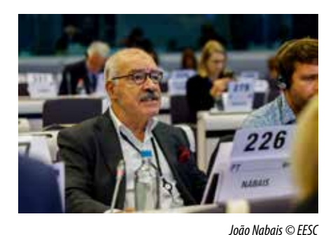
Joao Nadais © EESC

In line with the rapporteur's speech, Ariane Rodert emphasised the urgency of the opinion: "we need to develop an action plan for civil society", and specified that "funding is one component but there are so many more."